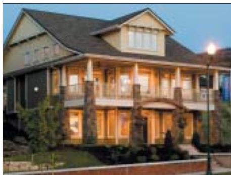
The Brookmere - Kentland Homes

As part of Kettle Valley Development, Kentland Homes built much of the Village residences since the Development came to life in 1996. Now that Kentland has made a name for itself, we've decided to make it official and incorporate the company. With that comes a new look and new opportunity including the resources to design and build custom homes. Looking to build your dream home in the Village of Kettle Valley? Give Kentland Homes a call at (250) 764-1306.