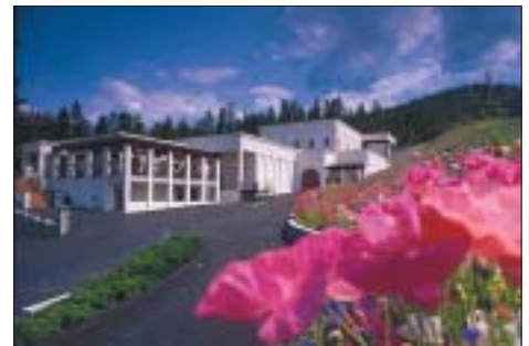
Cedar Creek Winery

Finally, we invite you to come visit our Kettle Valley show homes for the perfect end to a great Okanagan day.