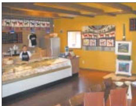
Carmelis Goat Cheese Artisan

On the scenic drive up, don't forget to stop by Summerhill Winery to enjoy a gourmet patio lunch overlooking Lake Okanagan. Summerhill's organic vineyard offers several varietals including Cipes, recently voted Canada's best sparkling wine.