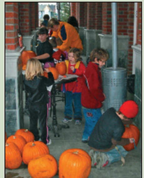
Pumpkin carving on the steps of Cherry Hill Coffee Shop.

There are many more events planned by the developer, Cherry Hill Coffee Shop and residents for 2005 including: Robert Burns' Night; Saint Patrick's Day; Easter egg scramble and parade; children's outdoor animated film night; radio controlled airplane air show; Christmas light up and Gingerbread Drive.